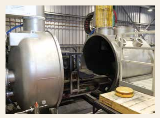
One of the new PAM units at the refinery.

The Perth Mint Refinery is always looking for ways to make processes cleaner, safer and more efficient.